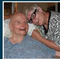
Caregivers need champions, too

To make a donation please visit www.MealsOnWheelsOC.org or call 714-220-0224.