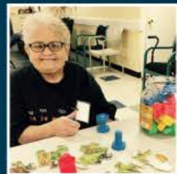
Happiness is people to talk to

We nourish the wellness, purpose and dignity of seniors and their families in our community.