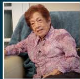
I was so happy when you came to help me