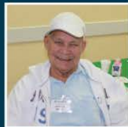
Feeling loved and cared for at Adult Day Services